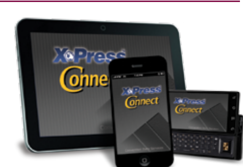
System Requirements: Android – compatible with phones and tablets (2.x or higher) Apple iOS – compatible with phones and iPads (3.x or higher) 3 megapixel or higher camera is recommended