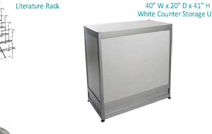
White Counter Storage Unit